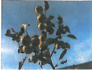
Malus "Golden Hornet"