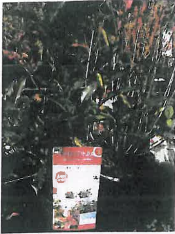
Photinia "Magical Volcano"